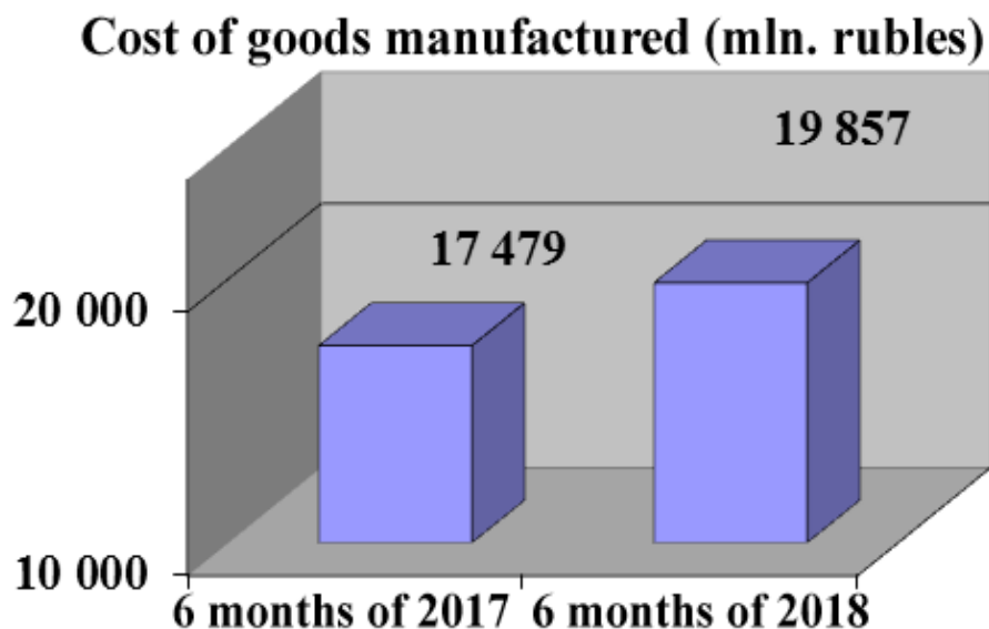
Expenses of Kubanenergo PJSC within 6 months of 2018